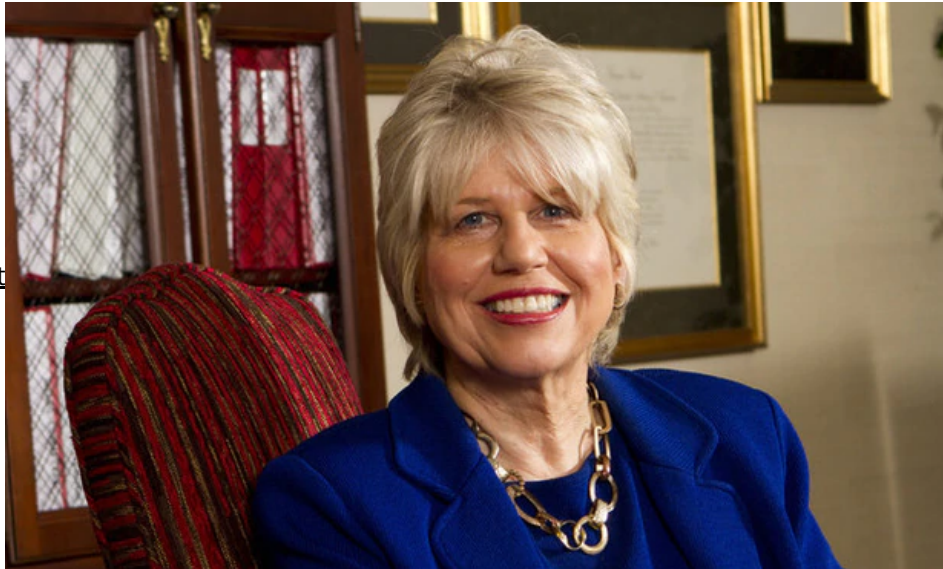
Judge Julie Carnes, U.S. Court of Appeals for the Eleventh Circuit

The U.S. Court of Appeals for the Eleventh Circuit ruled a trial judge was correct in awarding nominal damages and more than $115,000 in fees but incorrect in tossing claims for emotional distress and punitive damages for a Florida couple who were repeatedly reported in arrears for a house they no longer owned.